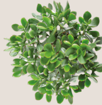
Crassula minova magic