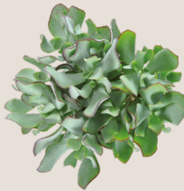
Crassula curly green