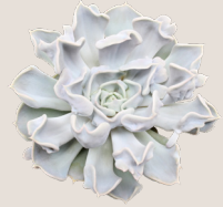
Echeveria thriller pearl