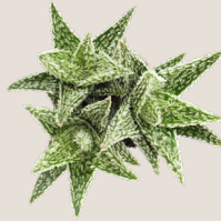
Aloe sugar crystal