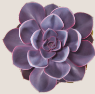
Echeveria purple pearl