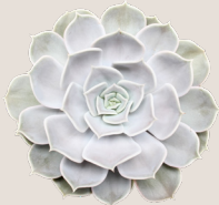
Echeveria silver pearl