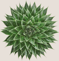
Aloe aristata magic