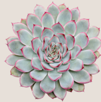
Echeveria sky pearl