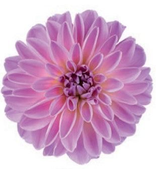
Dahlia Novation Hot Pink | 73950