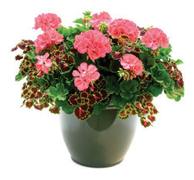
Geranium Big EEZE Foxy Flamingo | 21560 Coleus Great Falls Iguazu | 70942