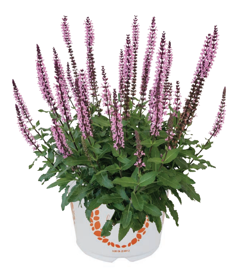
Salvia Midnight Rose | 81144