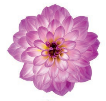
Dahlia Novation Pink Bicolor | 73954