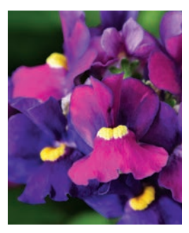
Nemesia Escential Bumbleberry | 72317