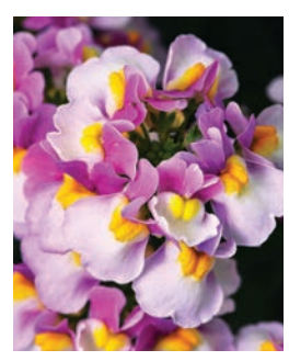
Nemesia Escential Pinkberry | 72318