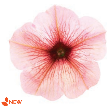
Petunia DuraBloom Soft Pink | 41742