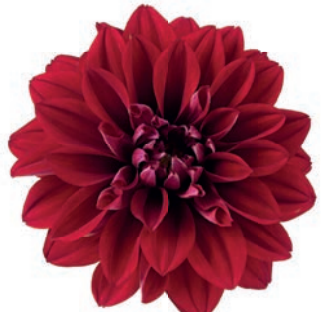
Dahlia Novation Red | 73951