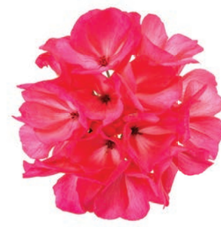
Pelargonium Big EEZE Foxy Flamingo | 21560