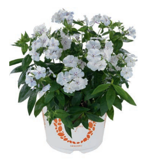
Flame Pro Light Blue | 80171