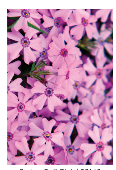
Spring Soft Pink | 82146