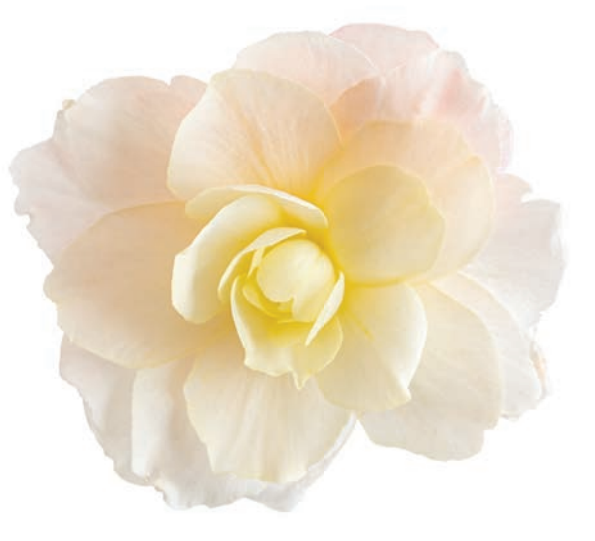
l'Conia Bacio White | 50752