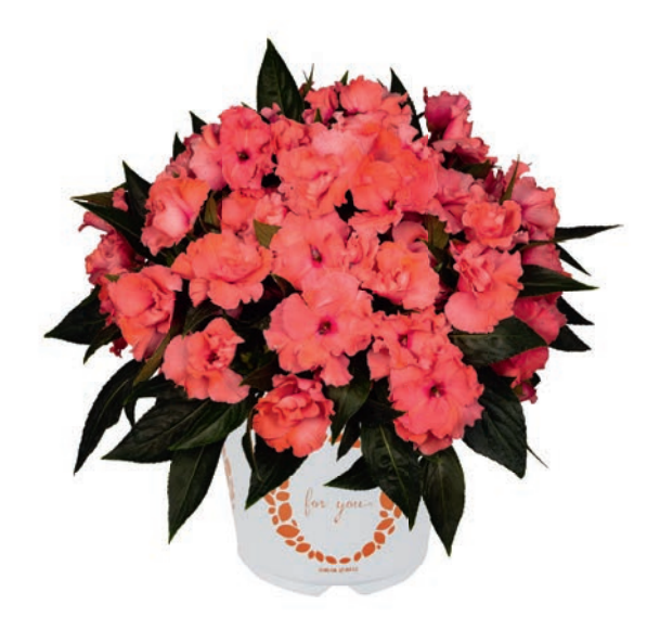
NEW Roller Coaster Tangy Taffy | 30426