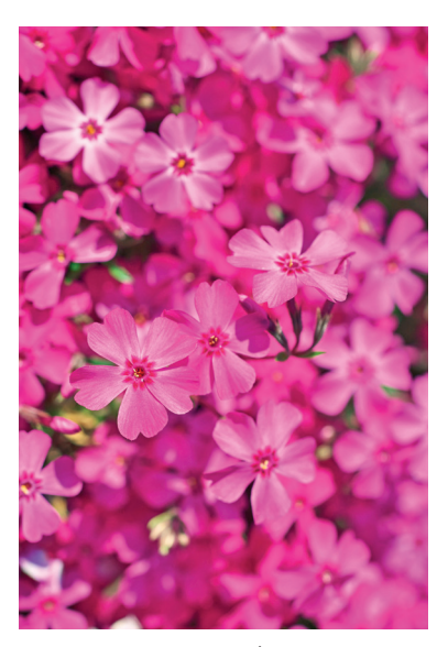
Spring Pink | 82137