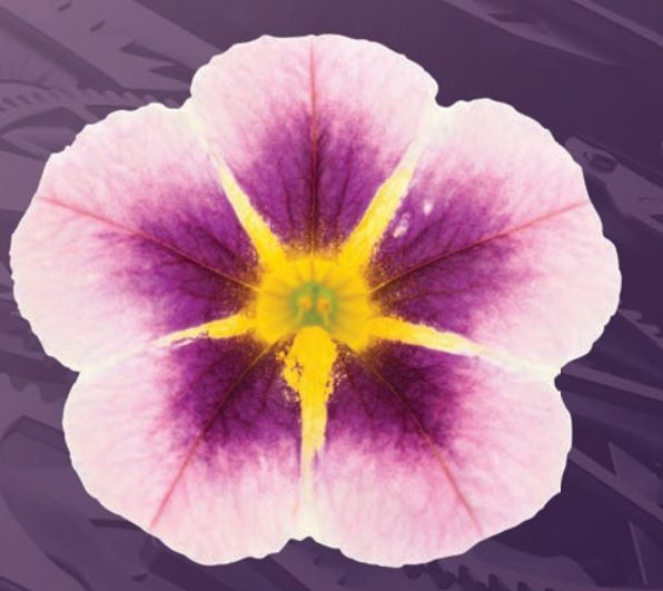
Calibrachoa TikTok Grape | 44035

The TikTok series is the newest addition to the Dümmen Orange lineup. These blooms have a fun, playful pattern with a unique pattern resembling the hands of a clock. The plants have medium-strong vigor and are well suited to hanging baskets and combination containers.