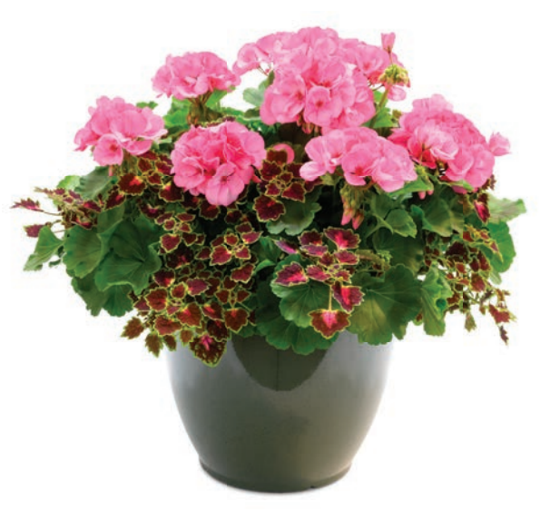
Geranium Big EEZE Pink | 20882 Coleus Great Falls Iguazu | 70942