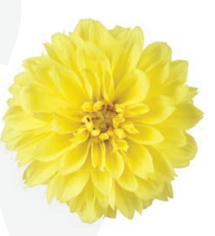
Dahlia Novation Yellow | 73578