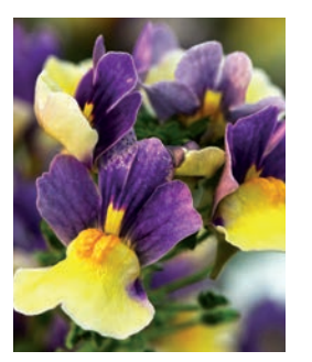
Nemesia Escential Blueberry Custard | 72313