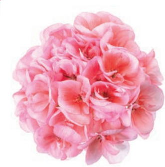
NEW Pelargonium Big EEZE Salmon | 21178