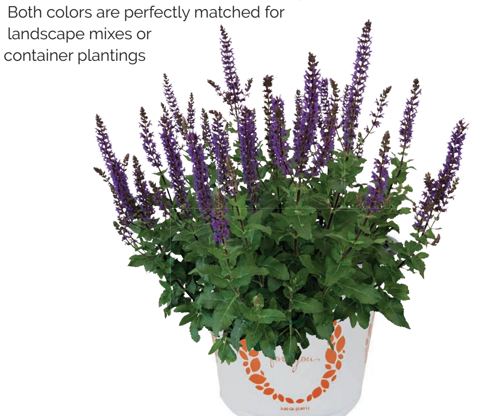
Salvia Midnight Purple | 81143