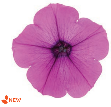
Petunia DuraBloom Electric Lilac | 40906