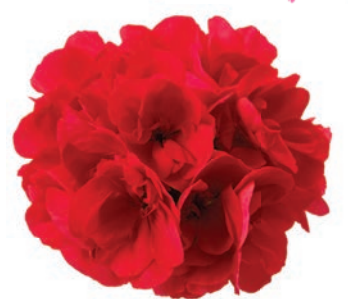
NEW Pelargonium Big EEZE Watermelon | 21179