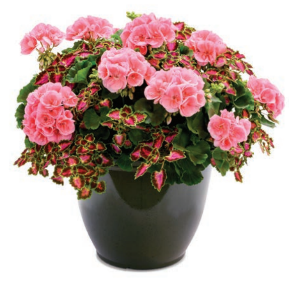
Geranium Big EEZE Salmon | 21178 Coleus Great Falls Angel | 70948