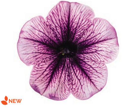
Petunia DuraBloom Blue Vein | 41746