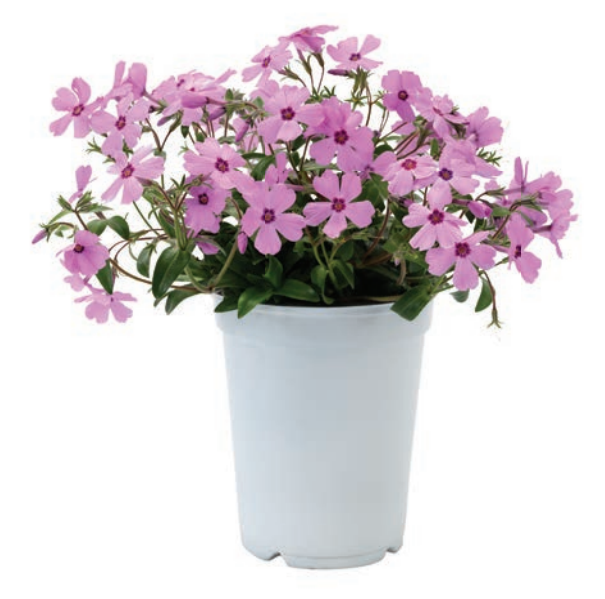
Phlox Woodlander Rose | 77238