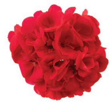
Pelargonium Big EEZE Neon | 20878