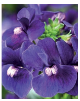
Nemesia Escential Blackberry | 72310