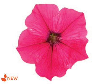
Petunia DuraBloom Watermelon | 41633