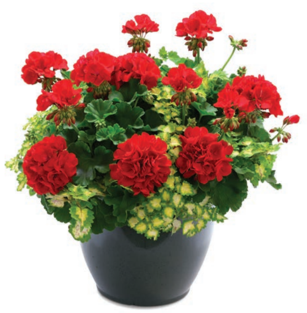
Geranium Big EEZE Dark Red | 20873 Coleus Great Falls Yosemite | 70945