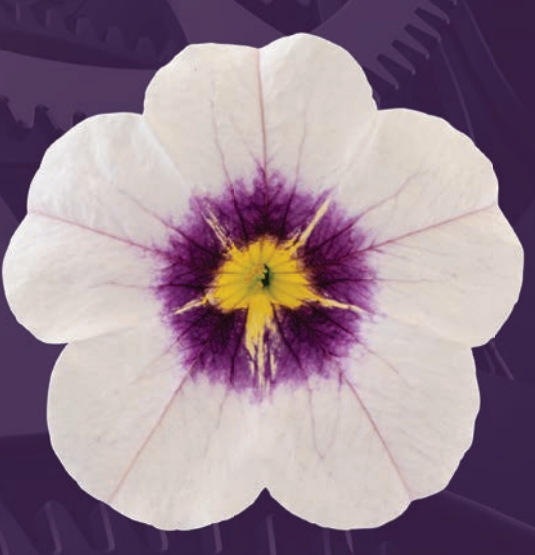
Calibrachoa TikTok White | 43579