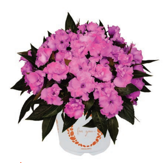
NEW Roller Coaster Valravn Violet | 30355