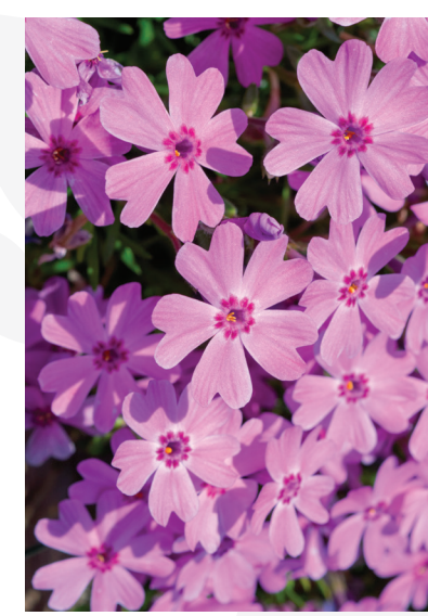
Spring Pink Dark Eye | 82147