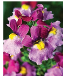
Nemesia Escential Strawberry | 72398