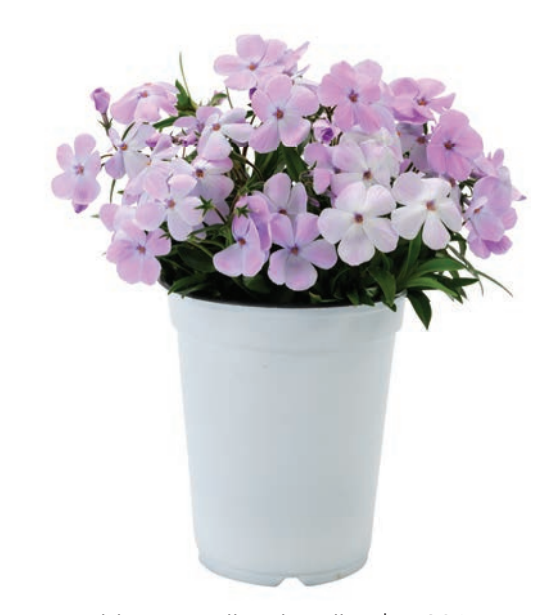
Phlox Woodlander Lilac | 77239