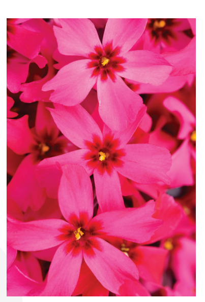
Spring Scarlet | 82136