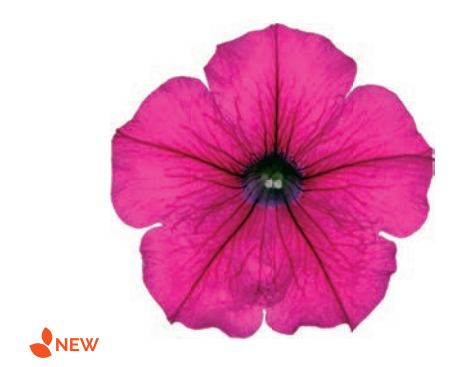
Petunia DuraBloom Hot Pink | 40985