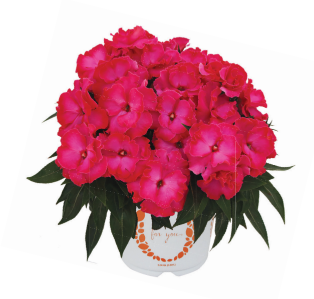
Roller Coaster Hot Pink | 30323