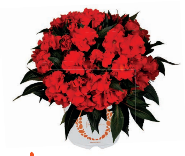
NEW Roller Coaster Red Racer | 30425