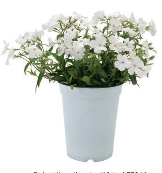
Phlox Woodlander White | 77240