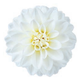
Dahlia Novation White | 73953