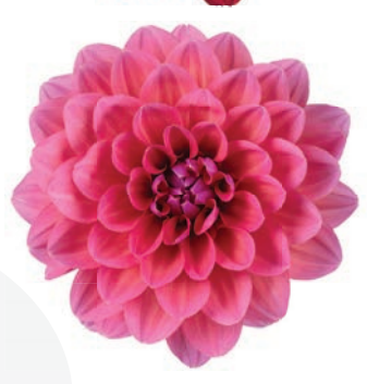
Dahlia Novation Salmon | 73828