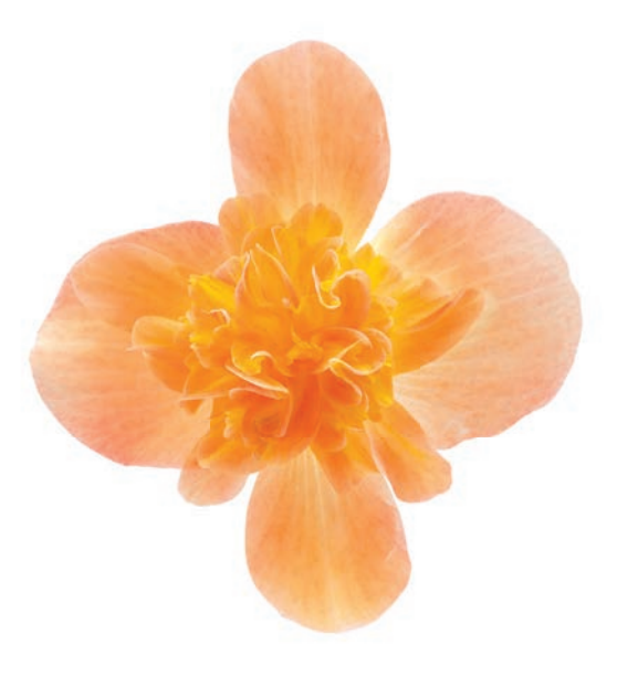
l'Conia Bacio Peach | 50768