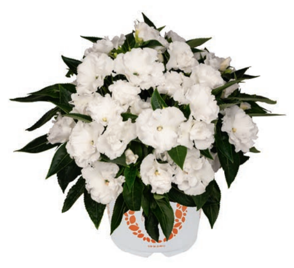
NEW Roller Coaster White Lightning | 30430