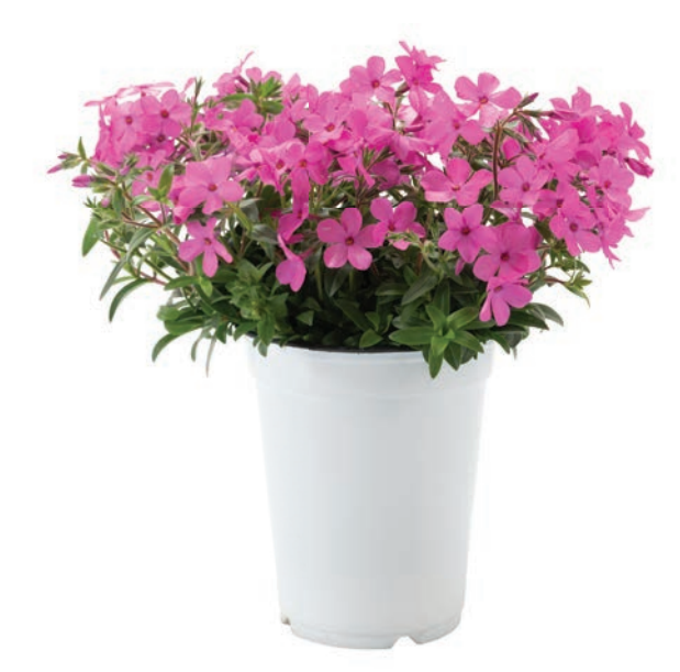
Phlox Woodlander Pink | 77237