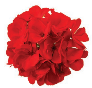
Pelargonium Big EEZE Dark Red | 20873