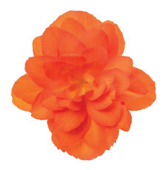
l'Conia Bacio Orange | 50763