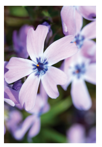
Spring Blue Improved | 82140