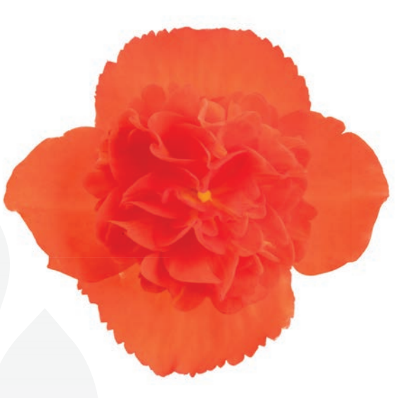
l'Conia Bacio Salmon | 50756