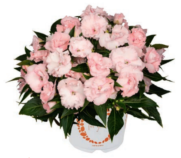
NEW Roller Coaster Cotton Candy | 30424