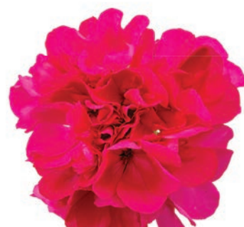
Pelargonium Big EEZE Fuchsia Blue | 20881