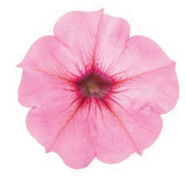
Petunia DuraBloom Royal Pink | 40989