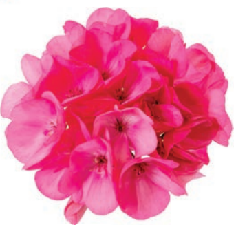
Pelargonium Big EEZE Pink | 20882