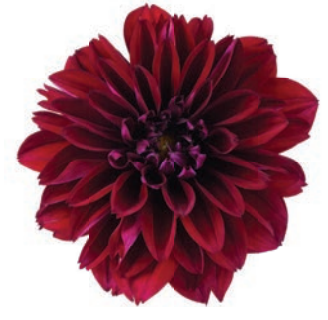
Dahlia Novation Ruby | 73949