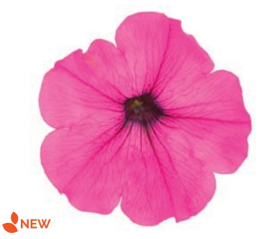
Petunia DuraBloom Purple | 41631