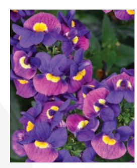
Nemesia Escential Sugarberry | 72399