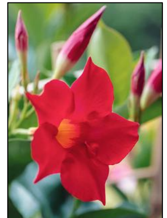
Sunvilla™ Red Mandevilla