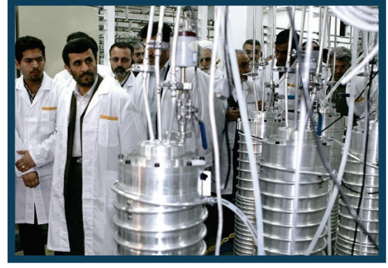
Mahmoud Ahmadinejad, President of Iran, inspecting centrifuges at Natanz Uranium Enrichment Plant in 2008.

being created for energy use, but other nations—and ostensibly the attackers—believed it was for nuclear weapons.) Because Iran never officially acknowledged the impact of Stuxnet, it isn't definitively known how successful Stuxnet was in its mission [20]. However, observers onsite at Iran's uranium enrichment plant at Natanz estimate up to 1,000 centrifuges may have been destroyed [21], [22]. In another example, in 2014 the German government reported that year a German steel mill was subjected to a cyberattack on its ICSs, resulting in "massive damage" [23], [24]. (Again, the full details remain unknown because they also have never been released by the victim.)