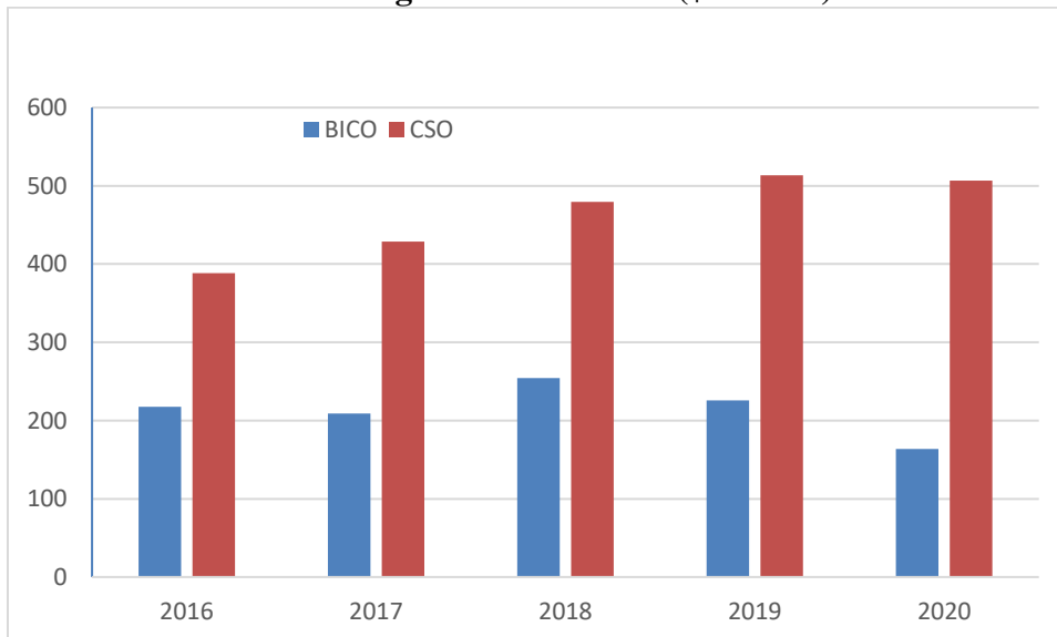
Chart 1: U.S. Food and Ag Trade to Poland ($ million)

*Data on CSO trade published by Trade Data Monitor (TDM)