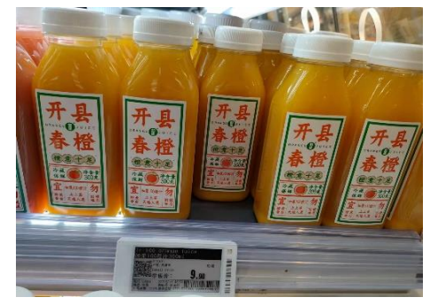
Orange juice at a local supermarket

Post forecasts an increase in frozen orange juice consumption in MY2021/2022 to 108,400 MT on increased consumer demand for 100 percent juice and NFC orange juice and greater availability of these beverages through various digital shopping platforms, vending machines, at sports clubs, and through expanded retail outlets. New style Chinese tea shops, juice bars and coffee shops