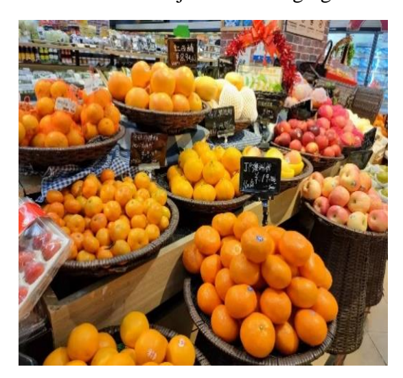
Tangerine and mandarin varieties at a local supermarket

Red Beauty, a seedless variety with a very thin peel and juicy smooth texture, is currently considered the most highend tangerine in China. Production is relatively small, and most production is in Zhejiang province. Meanwhile, new hybrid varietals are being developed and planted in other provinces as well.