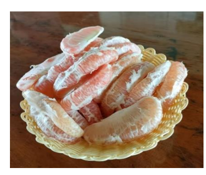
Green Jade variety pomelo grown in Guangxi