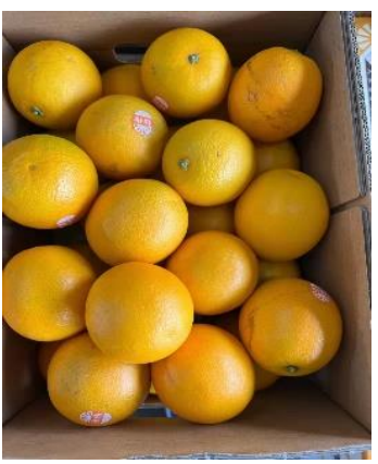
5kg box of branded Chu orange citrus from Yunnan

In MY2021/2022, the prices of early navel varieties remained flat in comparison with MY2020/2021. On average, navel orange orchard prices are about RMB 5 – RMB 6 ($0.72 -$0.85) per kilogram in the beginning of the season. The average retail price for bulk ordinary grade navel oranges from Jiangxi is about RMB 7 – RMB 12 ($1.22 -$ 1.75) per kilogram. Some high-end sweet oranges from Yunnan retail between RMB 36 - RMB 57 ($5.50-$8.80) per kilogram. Consumers are willing to pay a higher price for Chu branded domestic orange fruit because of the fruits' balanced acid-brix ratio and consistent quality. The stable supply which customers can routinely find in stock at markets, gives them an easy and reliable choice.