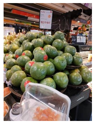
Yunnan red flesh grapefruit can retail for $10-$12 USD each in supermarkets

Consumption of grapefruit (including pomelo) in MY2021/2022 is forecast at 5.08 MMT, up 5 percent from the previous year estimate. Fresh grapefruit consumption will be partly driven by increasing demand from