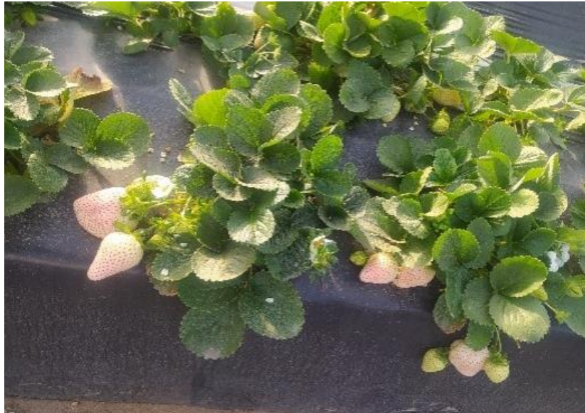
FAS Madrid picture of Florida Pearl variety grown by EMCO CAL.