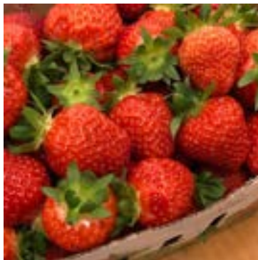
Source: KMO project, Fondation Gaïa Nova, Québec, strawberries grew under Sollum's LED grow light solution.

Strawberries benefit from far-red light to prevent leaf stacking and improve canopy aeration, especially in the first months of production. Other plants, such as winter peppers, benefit from far-red light mid-season to prevent pepper stacking. Far-red light stretches the nodes and facilitates crop work in snacking cucumbers, while also shortening the time between transplanting and harvesting. Transitioning to dynamic lighting allows growers to create and revise lighting zones at any point, ensuring that each plant is receiving the ideal lighting conditions. This can help growers manage different crops and cultivars. By understanding and utilizing specific lighting for different crops, growers can quickly adapt to challenges to attain peak productivity and improve ROI.