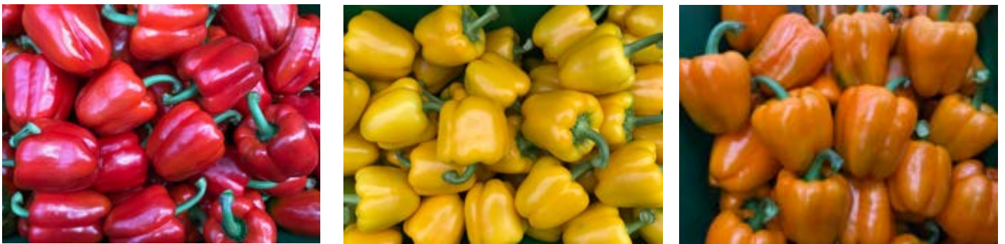
Source: Allegro Acres, Ontario, peppers that grew under Sollum's LED grow light solution.

Dynamic lighting allows growers to create distinct lighting zones to apply optimum lighting conditions for each crop or variety. Specific lighting zones can be positioned over yellow and orange pepper varieties to prevent bronzing. Similarly, the greenhouse lighting can address red-leafed and green-leafed lettuce varieties and/or according to the optimal DLI. The best part is that these lighting strategies are not set in stone at the start of the season and are changeable via Sollum's SUN as a Service® (SUNaaS) cloud platform. Sollum's cloud-based system provides a simple drag-and-drop user interface and access to light recipes to facilitate zone management.