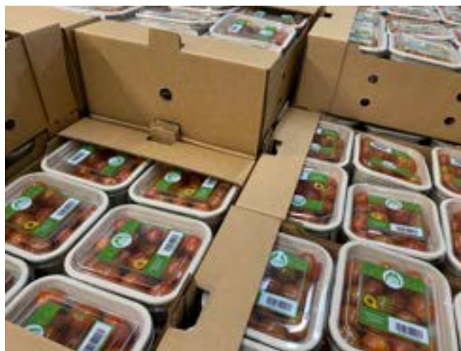
cherry tomatoes that grew under Sollum's LED grow light solution

Different crops have different lighting requirements as it relates to photoperiod, spectrum and light intensity, which can make it difficult to change crops and still get the most of the greenhouse. Crop changes are a reality of the greenhouse industry due to market influences and pest/disease cycles. For example, rugose in tomatoes requires removal of the infected crop, thorough disinfection and often a complete crop change to plants such as cucumbers or peppers. Greenhouse growers can address these challenges by transitioning to dynamic lighting and adapting their lighting parameters to the new crop's specific requirements.